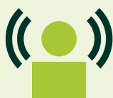
CAV HUMAN FACTORS AND HUMAN-MACHINE INTERFACE