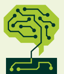
CAV COMPUTER VISION AND AI