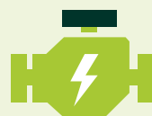
CAV SENSORS AND SENSOR FUSION